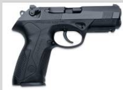
A PX4 Storm semi-automatic pistol