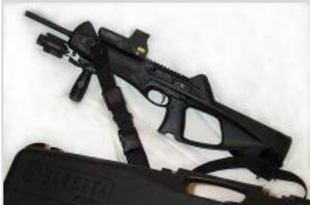
A CX4 semi-automatic carbine

According to documents obtained by the Italian magazine Altraeconomia , the shipment was for 1,800 Benelli calibre 12mm shotguns, 7,500 semi-automatic Beretta pistols cal.9x19mm series PX4 Storm each equipped with one extra magazine and accessories, and 1,900 semi-automatic carbines cal.9x19mm series CX4 Storm each equipped with one extra magazine and accessories. The end user certificate, dated 10 June 2009, confirms that the exporter was Beretta and the recipient was Libya's General People's Committee for Public Security in Tripoli.